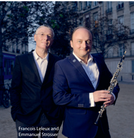
Francois Leleux and Emmanuel Strosser