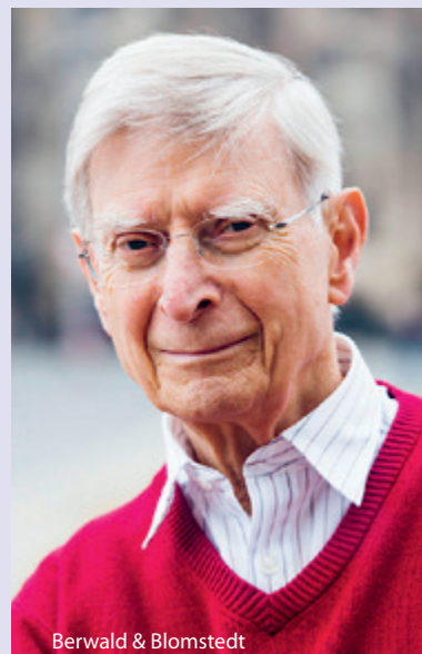
Berwald & Blomstedt