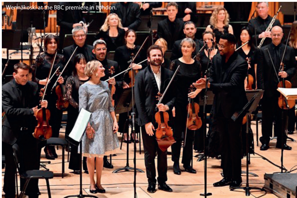
Wennäkoski at the BBC premiere in London.