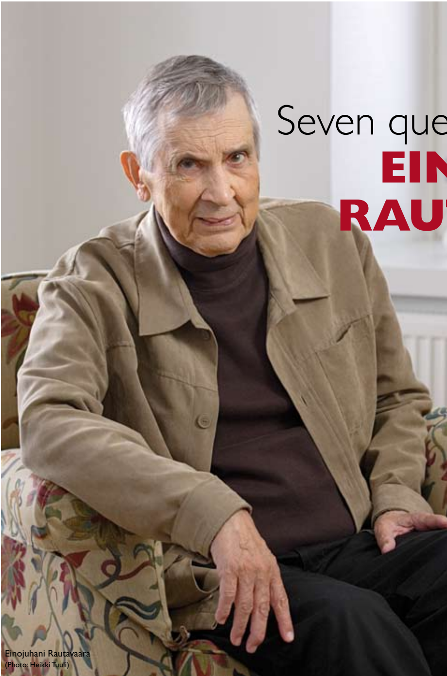
Einojuhani Rautavaara